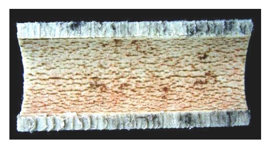
Fig. 1. View of inner surface of the pipe after examination - PPR DN 32 pipes after 40 months of operation

examinations are documented below (Figures 1, 2a and 2b): PPR DN 32 pipes after 40 months of operation - hot water was hygienically treated with chlorine dioxide produced "in situ". As shown in Figure 1, the inner surface of the pipeline has no "protective" mineral deposit. Operating problems with frequent pipeline accidents had to be solved. On the basis of discussions held, a proposal for the transition to a method of hygienic safety using stabilized chlorine dioxide (sCHD 100L) was prepared. One litre of this liquid biocidal agent contains approximately 110 g of active ingredient.