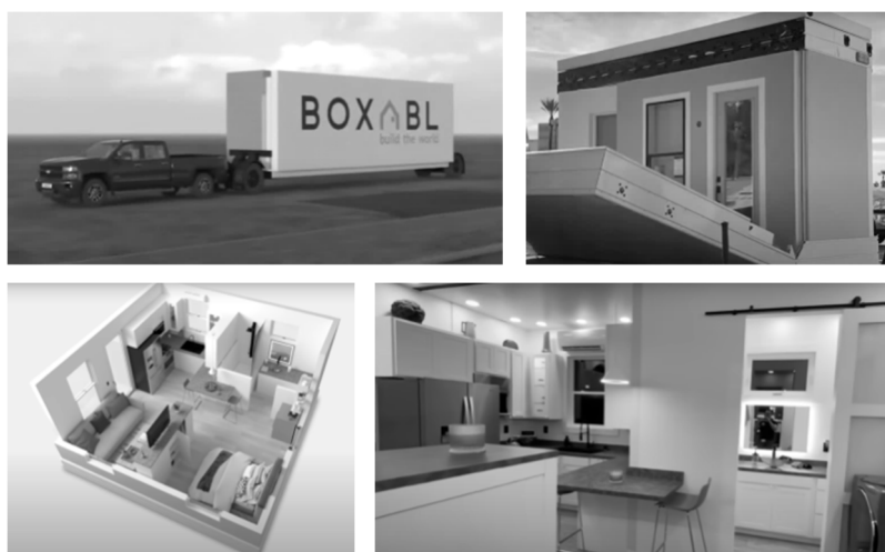
Fig. 3. Photos from the movie <<Elon Musk's mobile home>> ( YouTube · FutureUnity PL 24 September 2022)