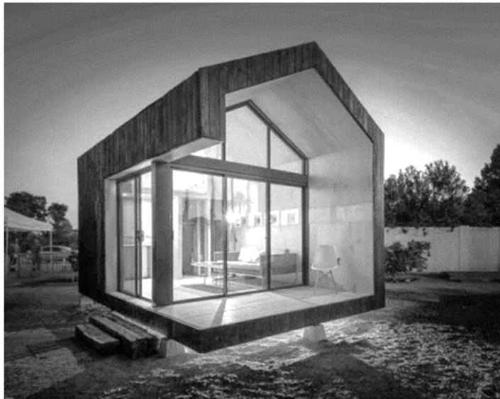
Fig. 2. Tiny house

In recent years, with the emergence of the idea of sustainable development and eco-logical construction, a new approach to the design of living space has appeared, referring to minimalism, savings and anti-consumerism. The article [7] discusses the architectural trend called Tiny Houses, consisting of residential buildings with a very limited living space, but functional and meeting all physical and mental needs. In European and North American countries, i.e. in highly developed regions where residents experience all the privileges and inconveniences of living in a highly urbanized space, it is preferable to locate small houses in direct contact with nature (Fig. 2) [8].