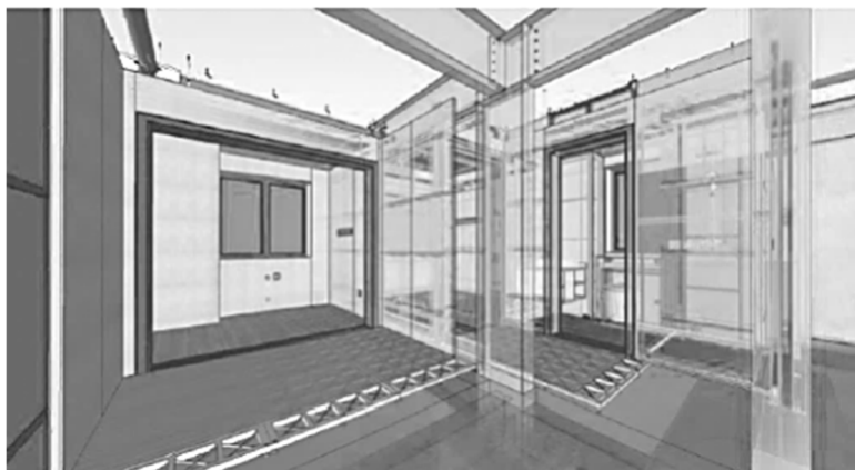
Fig. 4. Visualization of the BIM model of a modular house structure

It is advisable to implement BIM models of modular houses in combination with VR (Virtual Reality) technology in order to visualize and recreate the building structures (Fig. 4) [12].