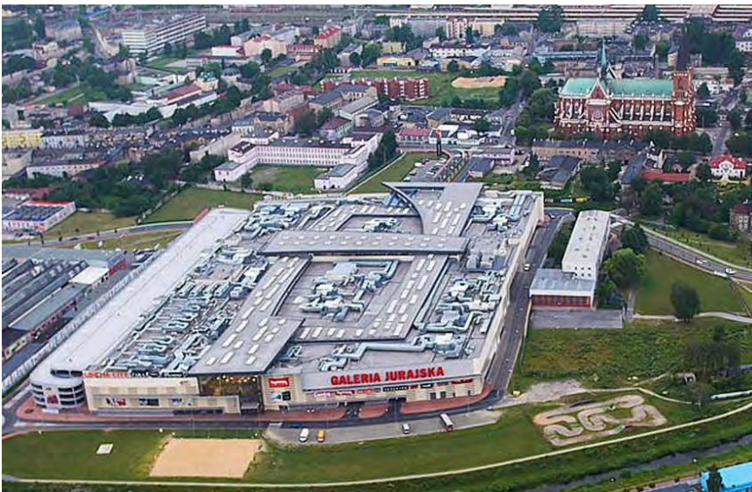
Fig. 4. The revitalisation of "island" terrain included a demolition of XIX century paper mill and replacing it with "Galeria Jurajska" shopping centre [6]

The next stage of transforming of the downtown area concerns the present time. To solve the spacial problems in the city centre the Czestochowa authorities organised SARP (The Association of Architects of the Polish Republic) contest in 1999 [2]. Its aim was the "Concept of Czestochowa Downtown Development." Another contest referring to the issue of downtown area took place in 2008 (also organised by SARP) [3]. The arrangement of Biegański Square and Daszyński Square with the part of St. Mary's Avenue between them was the subject of the contest.