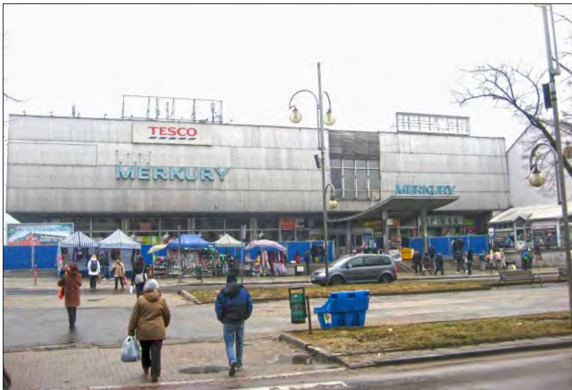
Fig. 3. "Merkury" department store. Located in the frontage of St. Mary's Avenue [5]

The next example of a building with a trading function, also realised in the seventies, was "Merkury" department store (Fig. 3). Located in the frontage of