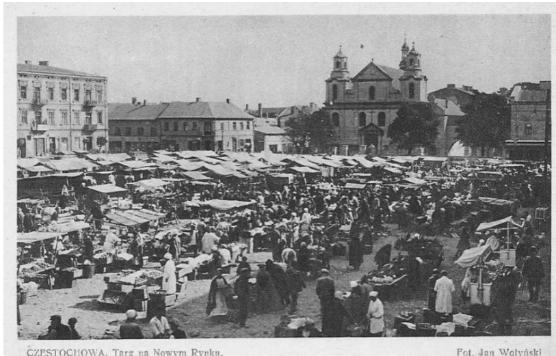
Fig. 1. The new market square at the connection of the Old Market and the square of St. Sigismundus' Church became an important element of the new urban organism [4]

Along with capitalism industry development the next plots located up St. Mary's Avenue are filled with townhouses. New shops are opened on the ground floor. The trading function reflects the needs of financial and goods exchange. A rapid development of the downtown areas took place. At the same time there was shifted the gravity point of mutual social, commercial and service relations.